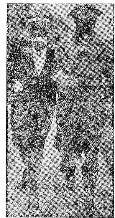
Germany, which will be ruled by a coalition government headed by a social-democrat, isn't letting any grass grow under her feet as far as preparations for the next imperialist war are concerned.

bureaucracy rules with a Mussolini-like autocracy.