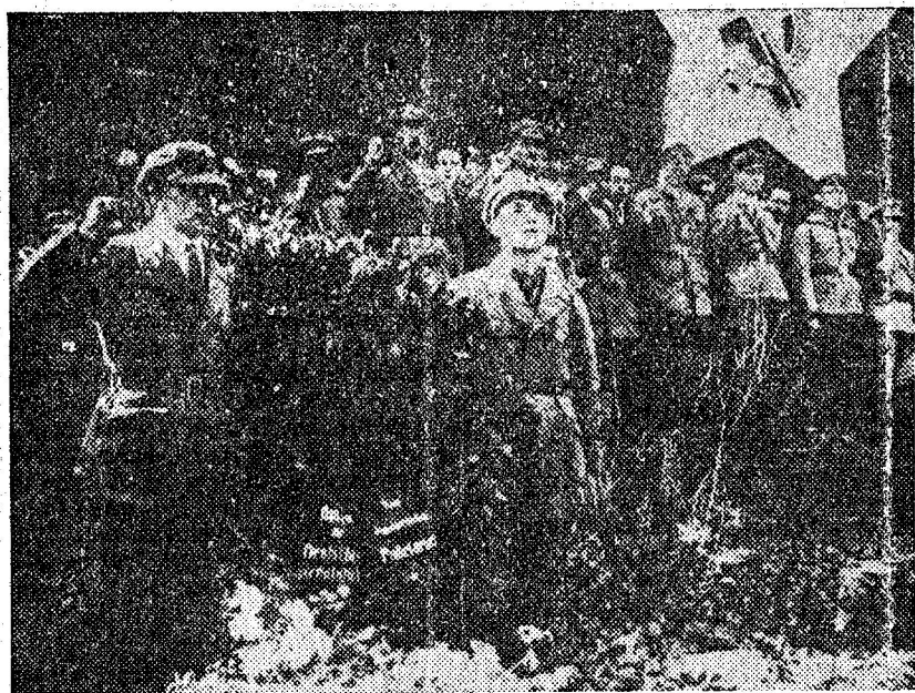
The picture shows a delegation of Swiss workers standing at attention beside the graves of Karl Liebknecht and Rosa Luxemburg in Berlin. The procession which marched to the graves of the two murdered revolutionary leaders included delegations from France, Great Britain, Austria and China.