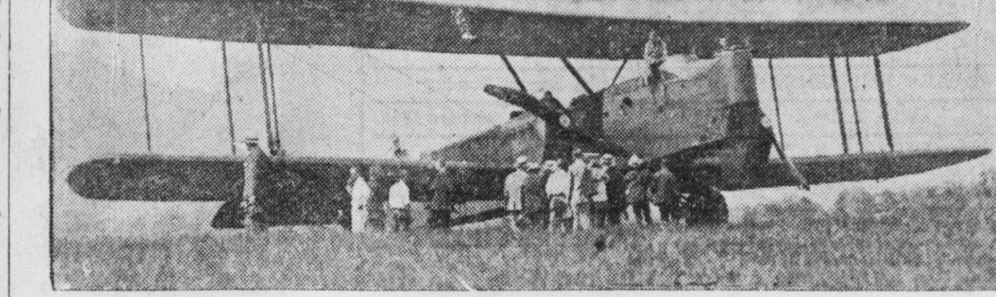
Photo shows the Keystone Super-Cyclops, the latest in bombing planes for the murder of workers in imperialist war. The new plane has been constructed for the U. S. Army and can carry 8 tons of explosives.