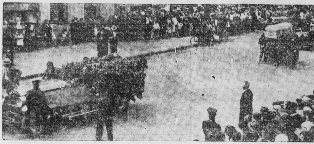
The same police department which only two days before brutally attacked an anti-imperialist demonstration in Wall St. joined in paying tribute to Frankie Yale, notorious gangster murdered in a gang war. Five hundred police escorted the princely funeral procession in a demonstration of the solidarity of Tammany Hall with the criminals of the underworld, the alliance which is receiving the backing of Wall St. Photo shows a view of the funeral procession.