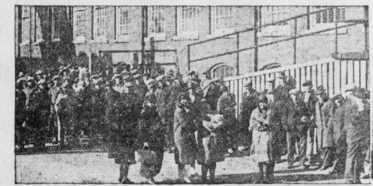
The beginning of the 13th week of the New Bedford textile strike will witness today the greatest mass picketing demonstration since the strike started in answer to the attempts of the bosses to open the mills. Photo shows typical picketing demonstration which will be increased manifold today.

Poverty Halts Graduation in Socialist City