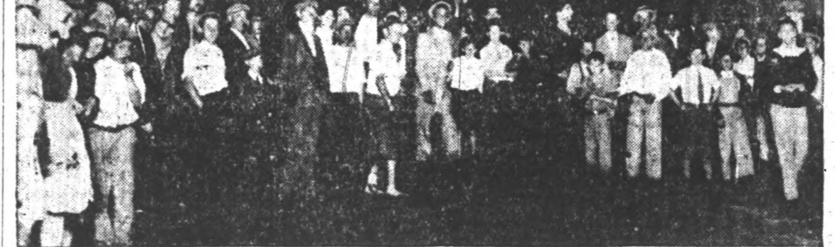
The most dramatic event of the New Bedford strike took place recently when a rumor that eight scabs had started the looms in the Kilburn mill brought out 18,000 strikers who continued to picket through the night. Pickets in fishermen's boats kept guard at the mill gates on the waterfront in this tremendous demonstration of the strikers' solidarity. Photo shows a group of pickets outside the Kilburn mill.