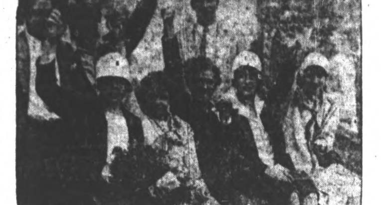
The Olympic sports meet, which will be held in Amsterdam this year, will involve the expenditure of thousands of dollars, all in the name of "amateur" sports. Hundreds of athletes, who are professionals in everything but name, from every European country except the Soviet Union, will vie for honors at this huge sports spectacle. Photo shows a group of American athletes just before sailing for Europe.