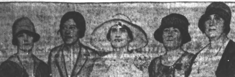
The women of the leisure class can hear their master's voice as well as the men. Some will work for Herbert and some for Al, but all will work for Wall St. Photo shows five of the women who will try to drum up the feminine vote for Smith.

PHILADELPHIA, Pa., July 15.—The women of the leisure class can hear their master's voice as well as the men. Some will work for Herbert and some for Al, but all will work for Wall St.