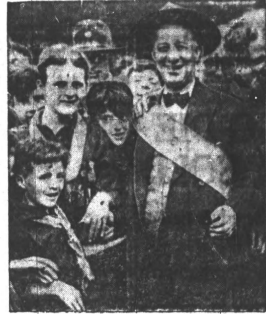
With Wall St. directing his campaign, Al Smith can now turn his attention to proving himself as hundred per cent jingo as possible. Photo shows Al with a group of Boy Scouts just after he had been re-elected Chief Scout by the young fascist military organization. The Tammany sackem feels perfectly at home in a military uniform.