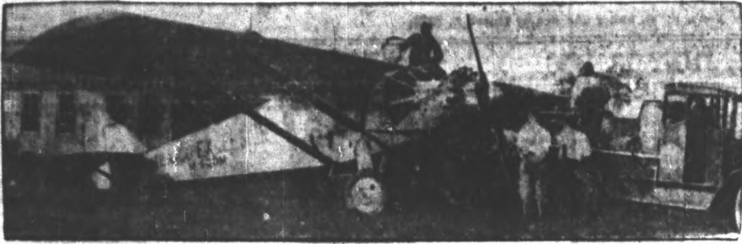
On the first leg of his journey from New York to Mexico City, Capt. Emilio Carranza, Mexican flyer, met death when his plane was hit by lightning in New Jersey. The Carranza flight was an exchange of courtesy in recognition of Lindbergh's trip, as part of the general program of the Mexican government of furthering American imperialist ambitions. Photo shows Carranza's plane being fueled just before he hopped off.