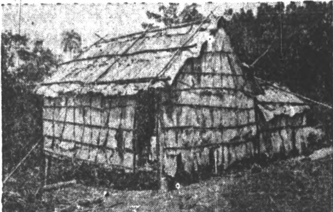
Hundreds of Porto Rico peasants, living in little match-box houses like this, perished when the hurricane swept over the island. These tiny hovels, in which Wall Street houses its Porto Rican serfs, could not witstand the storm.