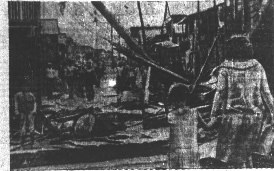
Thousands of homeless Porto Rican peasants are leaving their storm-wrecked little farms and flocking into San Juan. Above, homeless workers and peasants wandering thru the debris-filled streets of the city in the hope of finding scraps of food and shelter.

Streets of San Juan, Porto Rico, After Giant Disaster