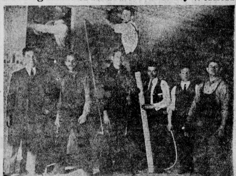
The six floors of the new Workers' Center are being rapidly prepared for occupation by the chief Communist Party institutions. Photo shows workers rushing completion of the alterations necessary.

Building Home of N. Y. Revolutionary Workers