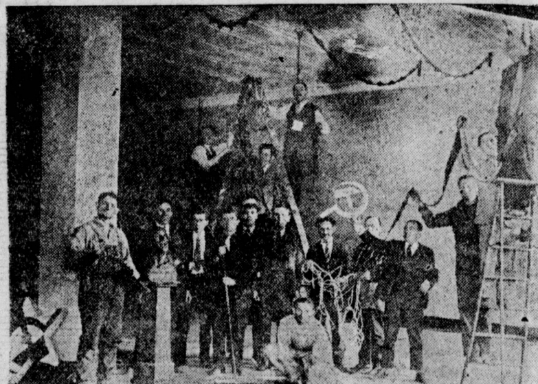
The gala opening of the new Workers' Center, 26-28 Union Square, held last Friday, was one of the most enthusiastic affairs in the history of the New York Labor movement. While it was possible to accommodate only 600 at the banquet, about 1,300 workers were present. Photo shows volunteer workers decorating the second floor of the Center where the banquet was held.

Decorating for the Successful "Red Banquet"