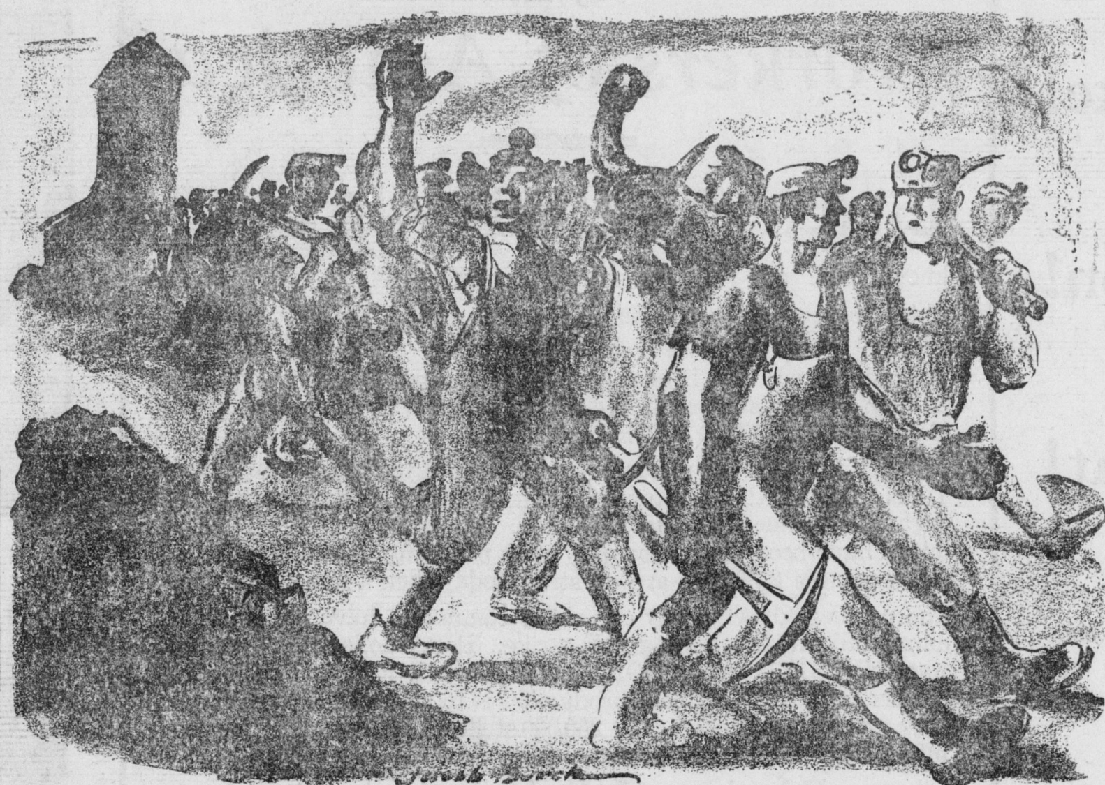
Soldiers of the mine pits! Marching in serried ranks in a rising revolt against the slavery of coal feudalism! Victory on the picket line!

recession set in, for the silk work- With no results from the so-called tho internal strife was not mani- other vital problems by the Associ- situation by methods of organization to leave the union in great multi- of the conference for unity unless ers unions. The patented medicines unity attempts these dual independ- fested in the independent isolated ated and the resultant conditions in but instead allowed the organiza- tudes of these leaders did not bring about ent unions began a downward jour- Paterson Associated Silk Workers the industry can best be judged from tion to keep on debating the quesorganization among the silk work- ney. War-time prosperity came to Union, to the extent that it was the closing chapters of the 1924 tion of whether victims of the 3 and