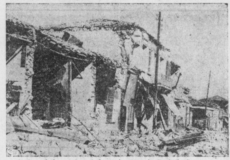
A view of the section of the main street in Corinth, Greece, in ruins after an earthquake had laid waste most of the city. Buildings along the entire length of the street shown in the photo crumbled to the