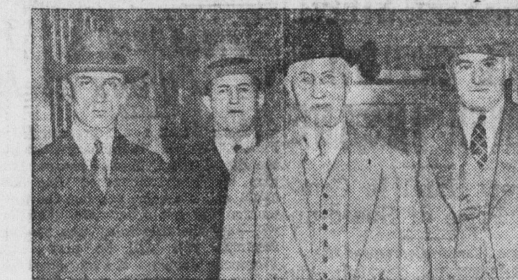
Cleveland workers shouted down Paul Milyukof (center) minister of foreign affairs under the deposed Kerensky regime, when he urged an attack against the Soviet Union at the alleged "peace" conference. Nineteen members of the Workers (Communist) Party were arrested for participating in the demonstration. Photo shows Milyukof guarded by hard-boiled Cleveland "dicks."