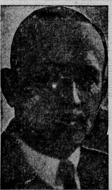
WILLIAM Z. FOSTER

parties have been built up. They have serious industrial depression.