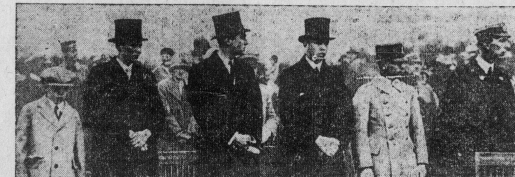
The tall persons in the picture are six scions of the Swedish royal house. If they look a little comfortable, it must be remembered that the Swedish working class is militant and the scions are never sure what may become of them.

Swedish Working Class Has Its Eye on These Parasites