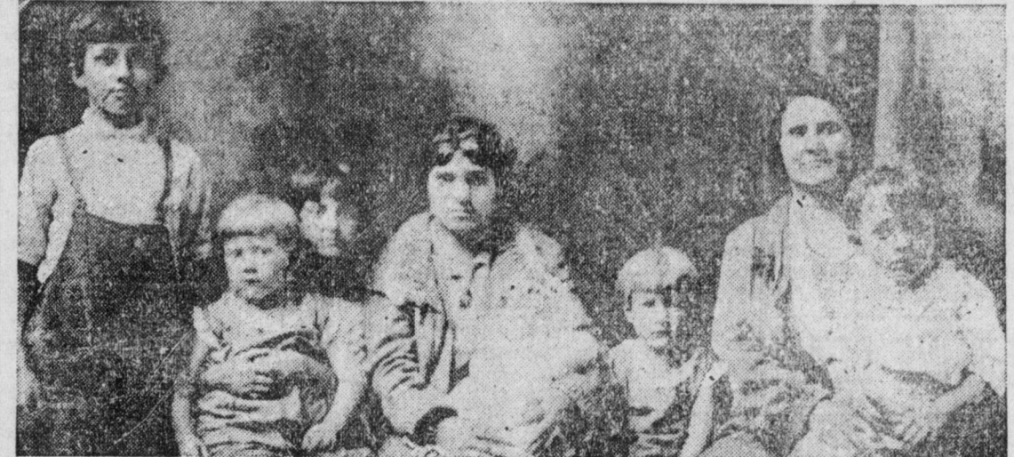
In New Bedford during the recent arrests young children were left in their homes unattended when their mothers were dragged from the picket lines to jail. A special childrens' kitchen is about to be opened by the Workers' International Relief, which is feeding the thousands of workers on strike.

Textile Families Who Have Suffered in Long Struggle