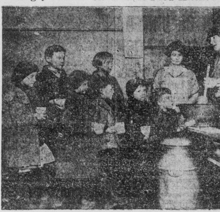
Photo shows hungry miners' children receiving a meal in a food kitchen run by the National Mine Relief Committee. Miners' children often faint in school because of under-nourishment. Starvation looms for hundreds of thousands of miners and their families if the workers of the United States do not rush aid at once