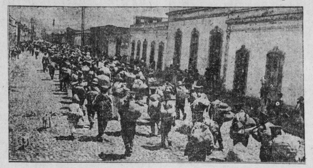
Photo shows federal troops massed for action outside Mexico City following the assassination of. Alvaro Obregon, president-elect of Mexico.

After Obregon Assassination; Federals Massed Near Capital