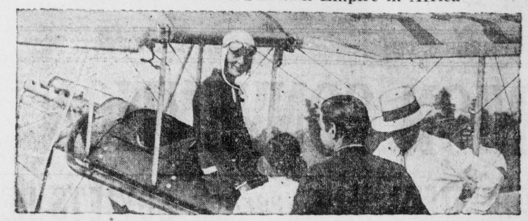
The plane in which Lady Heath, British aviatrix, flew from London to South Africa has been purchased by Amelia Earhart, American woman who flew the Atlantic. She is shown here with the plane which pioneered along the British imperialist air-ways.

Plane That Traversed British Empire in Africa