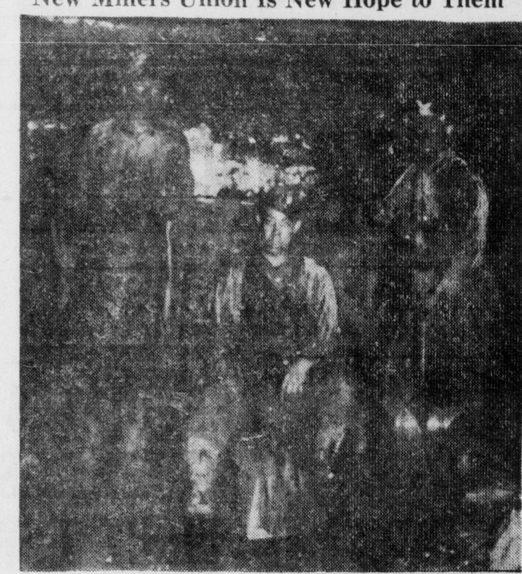
The first great ray of hope, spurring on the miners to new struggles has gleamed for the coal miners of the United States with the formation of the Miners Union in Pittsburgh. In spite of the terror launched against the rank and file delegates, the Lewis agents were unable to smash the Miners Convention. The police assisted the Lewis gangsters. Above, typical miners