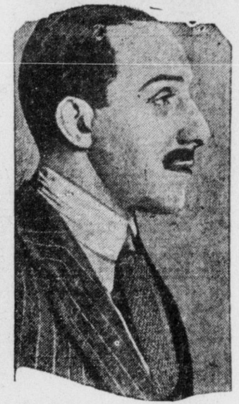
A bloody terror, in which thousands of workers have been imprisoned and tortured, reigns thruout Spain. Revolts threaten the throne of King Alfonso.