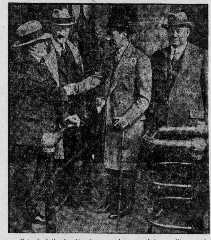
Friend of the traction barons, whose greed for profits cost the lives of a score of men and women at the Times Square, on August 24, Mayor James Walker has journied to Washington to attend the sessions of the I. R. T. hearing now taking place there.

300,000 for 1925-1926. "The increase of almost 30 per cate amounted to $54,300,000, except in trade over last year by no ceeding last year's figure by 23 per means represents the full extent of cent. the growth of the economic relacluded with American engineering industrial organizations of the Sovrutra, the corporation handling the able."