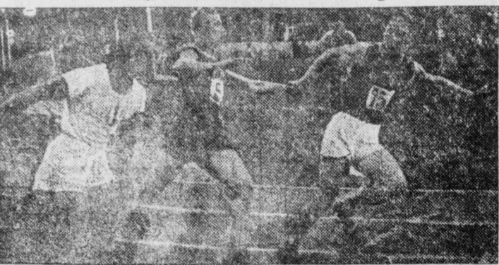
Thousands of workingclass athletes from many countries participated in the Spartakiade recently held in Moscow. Photo shows a tense moment in the 400-meter relay.

fair, and therefore not so surprised at the ease with which frame-ups of workers can be put over in this capitalistic state in which we live. He had been in one of the Automat restaurants on Broadway near 46th Street, and had stopped for a second just outside the door to light a cigarette, when an officer stepped up and arrested him.