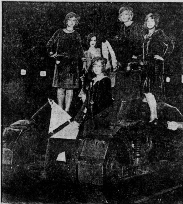
Photo shows group of chorus girls, posed above on tank, being used for propaganda for imperialist war. Photo was taken at the camp of the 258th Field Artillery, where preparations for a military show are being made.