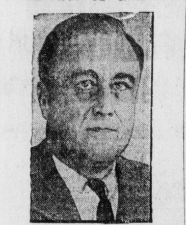
Franklin D. Roosevelt, above, has been chosen by the Tammany controlled graft-ridden democratic party as its candidate for governor in New York. The other party of Wall Street, the republican party, has picked Albert Ottinger, open shoppers' tool, for this office.

friend of the Soviet Union, the first and only workers republic.