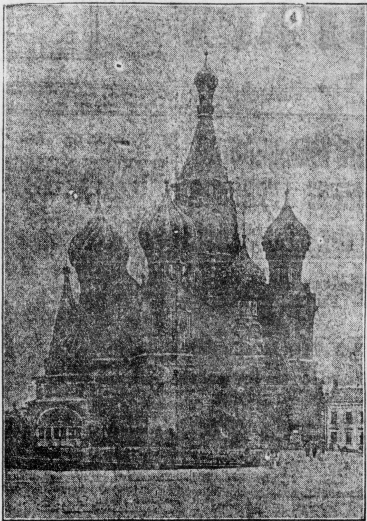
The "Cathedral of St. Basil," pride of the czars and their lackeys, has been turned into a museum by the Soviet Government. The magnificent building is situated in the southern end of Red Square, near the Kremlin, and is one of the many sights of interest to be visited by the group leaving for the U. S. S. R. on the "Mauretania" October 17 under the auspices of World Tourists, Inc., 69 Fifth Ave., New York City.