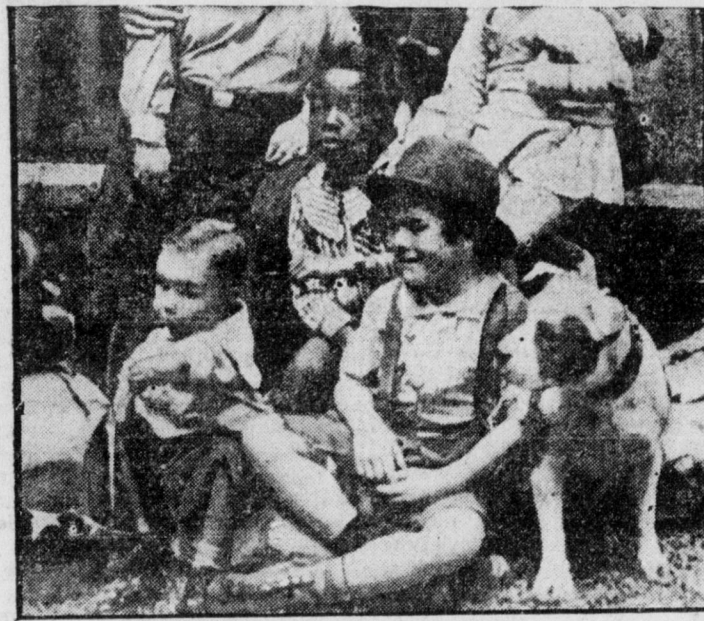
When the "Our Gang" troupe of child movie actors applied for rooms at the Hotel Roosevelt, New York, the management refused to house them because a Negro child, Allan "Farina" Hoskins (center, above), was one of the gang. The hotel bosses gave the young actor his first taste of race "equality" under the American capitalist system.