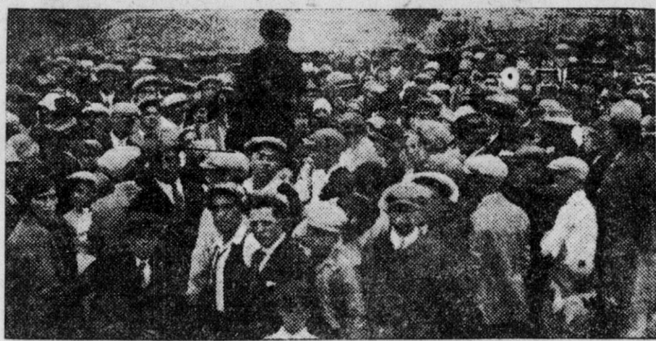
In spite of the terror with which the police and textile barons practice against their Fall River mill slaves, the workers are as militant as ever. Above, a speaker addressing the workers at a recent picnic near the city.