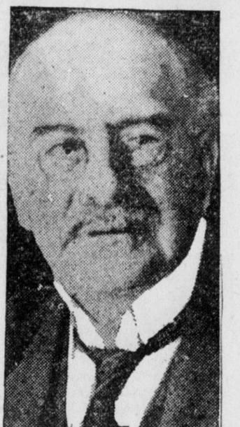
Lord Melchett (Sir Alfred Mond), British capitalist (above), is the author of a class collaboration plan over which J. H. Thomas and other English labor misleaders have shown enthusiasm. Militant British workers are fighting the Mond Plan for further enslavement of the workers.