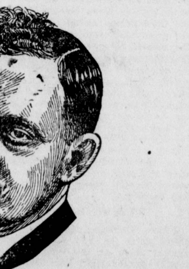
BENJAMIN GITLOW (Candidate for Vice-President)

COOPERATORS! Patronize the No Tip Colony Barber Shop Ladies Hair Bobbing a Specialty 665 - 67 ALLERTON AVENUE BRONX, N. Y.