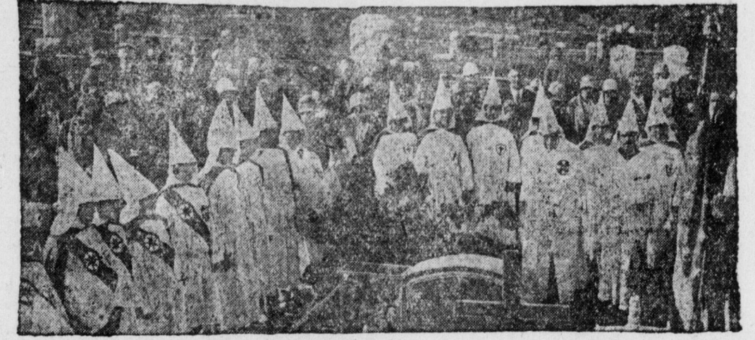
Woman ku kluxers appeared in full regalia at a funeral of another female ku kluxer in Lyn-

Ku Klux Women, Tools of Bosses, Demonstrate In Regalia at Funeral