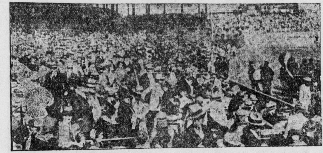
A good proportion of the tickets for the worlds' series games somehow fell into the hands of the ticket speculators; the ball magnates may know how this happened. Speculators extorted $5 and over from fans. Photo shows St. Louis crowd watching Cardinals drop final game of series to the

St. Louis Ball Fans Pay Fancy Prices to See Home Team Drop Series WORKERS PARTY Workers Party Activities WORKERS FACED