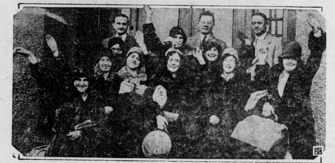
Given 19 days in the Kenosha jail for defying the bosses' injunction to prevent them from picketing the struck Allen-A hosiery mill, the nine girl strikers above were liberated by funds raised by sympathizers at a protest meeting recently. Men pickets refused to receive similar bail, prefering to protest their sen-

Freed by Sympathizers After 19 Days of Prison