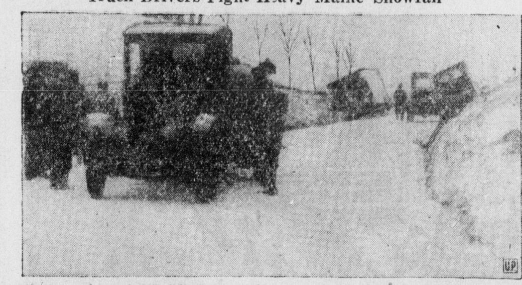
Heavy snowfall made Mill Hill at Herman, Me., almost impassable and truck drivers were forced to labor for hours in an effort to get thru. Photo shows a truck stalled at the side of the road,

Truck Drivers Fight Heavy Maine Snowfall