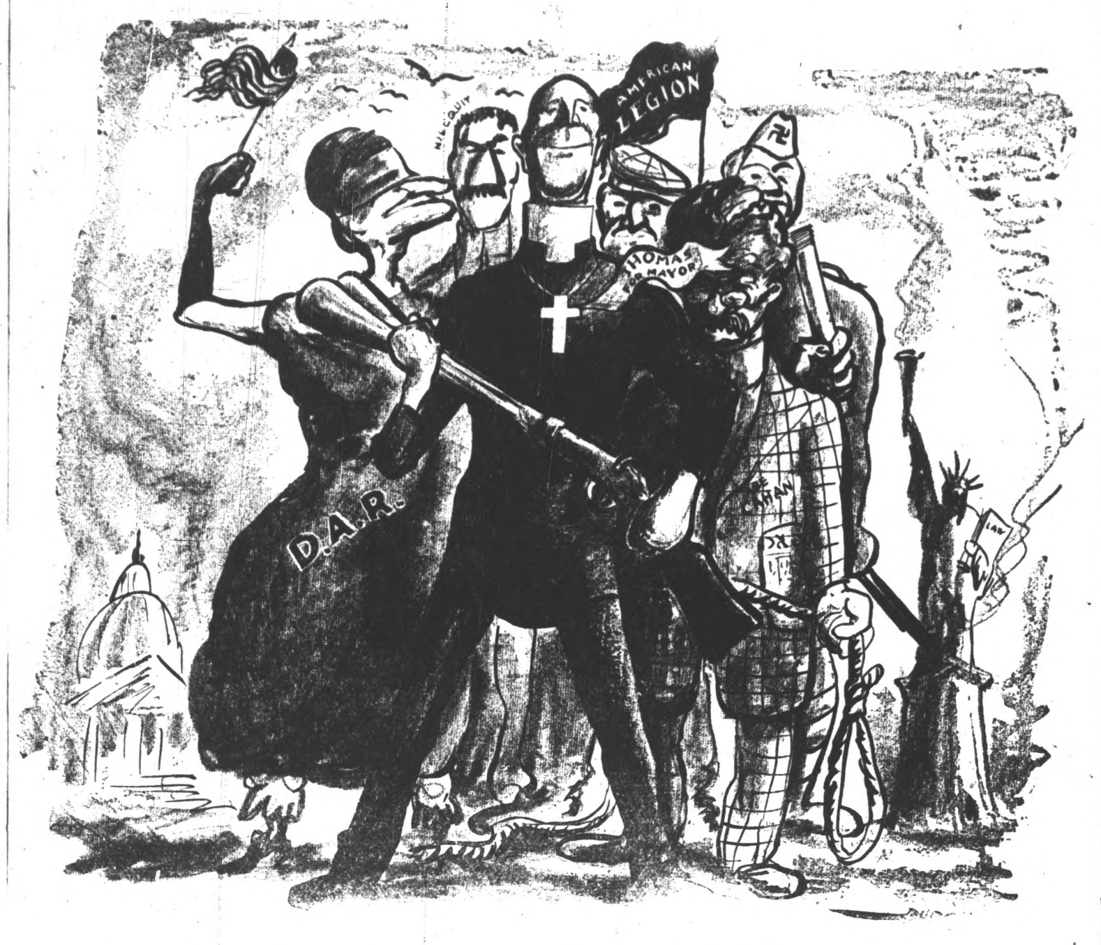
The Socialist Party declares that the workers must fight for a more "efficient" police force.