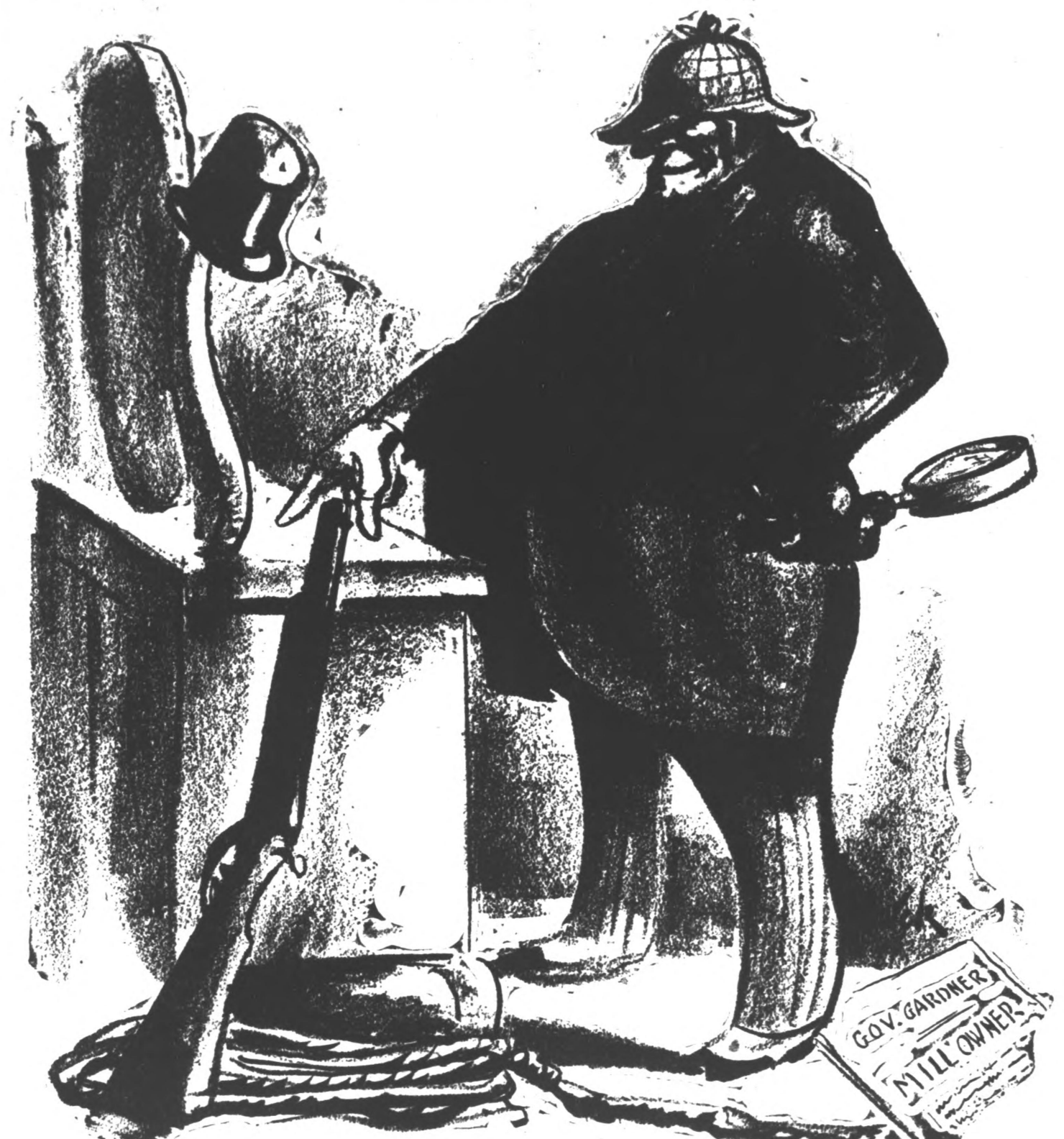
County Solicitor Carpenter (after a hard day's lynching): "Now We'll Investigate!"