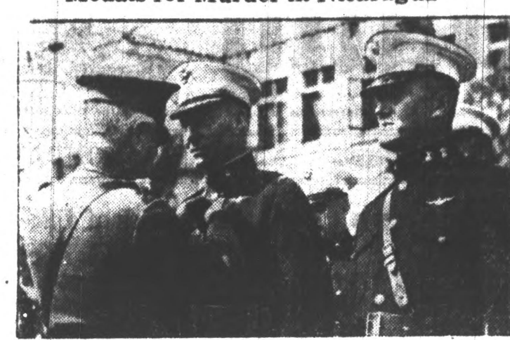
Brig. Gen. Pendleton decorating two majors of the Wall Street marines at San Diego for leading the murder of Nicaraguan workers