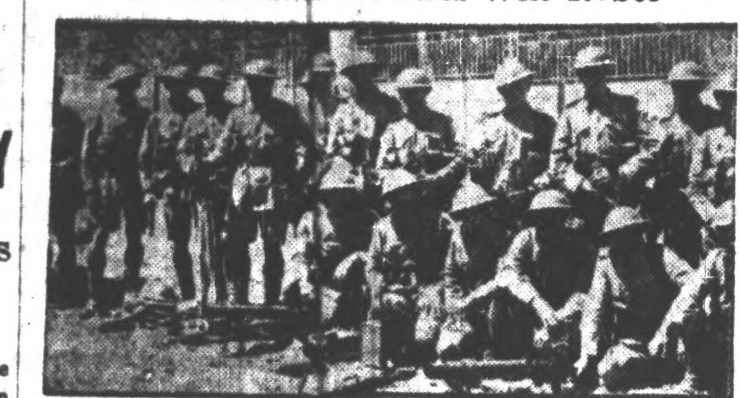
Photo shows British chine gunners shooting down Arab werkers who rebelled aga British imperialism and Zionism, its tool in keeping Arabs substed.