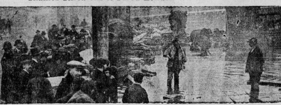
The Thames is rising and has already begun to overflow its vanks. threatening the workers' section which lies along its shores. Above, workers building dams to stem the flood.

Thames Threatens to Flood London Workers' Section