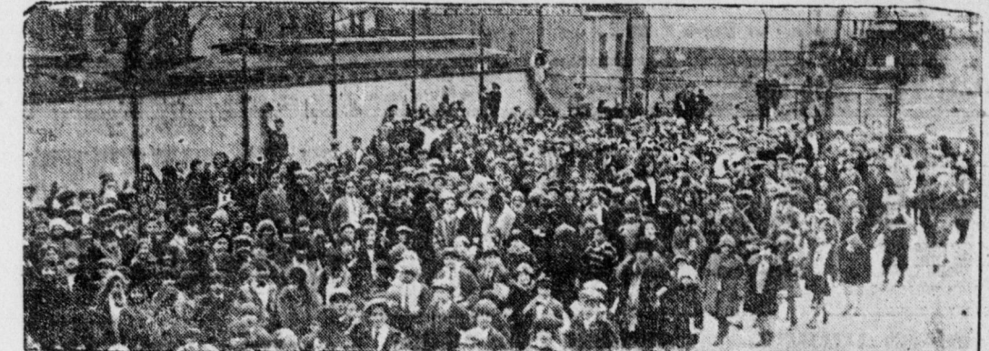
The pupils of a Brooklyn school are shown playing in the school yard after winning a strike which came to an end when the principal promised the parents aid in securing street improvements.