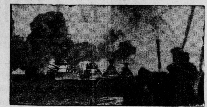
Photo shows the Richmond Grays, a military organization sworn to defend the capitalist system, warming up for the ceremonies which will usher in the Hoover administration of graft and imperialism.

OOVER OUTLINES On Parade for Hoover, Imperialism and Graft REPORT REVOLT