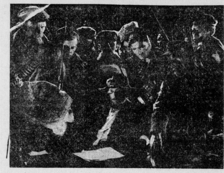
A tense scene from the Sevkino film "Ten Days that Shook the World," which finishes a four day run at the Cameo Theatre tonight. The picture was directed by Eisenstein