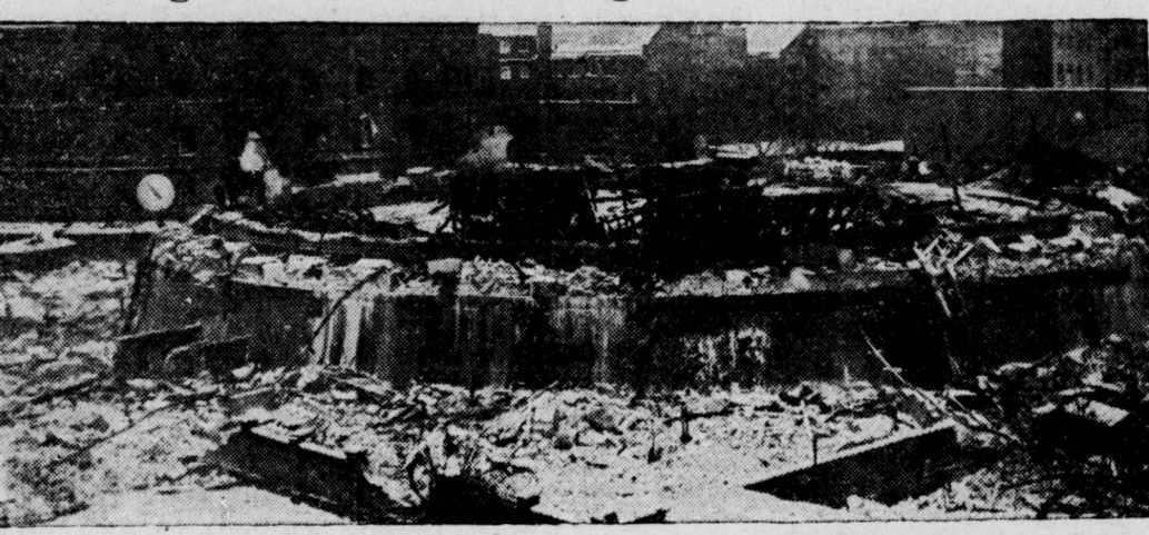
Several workers were hurt when a huge gas tank exploded in Berlin, rocking the neighborhood for