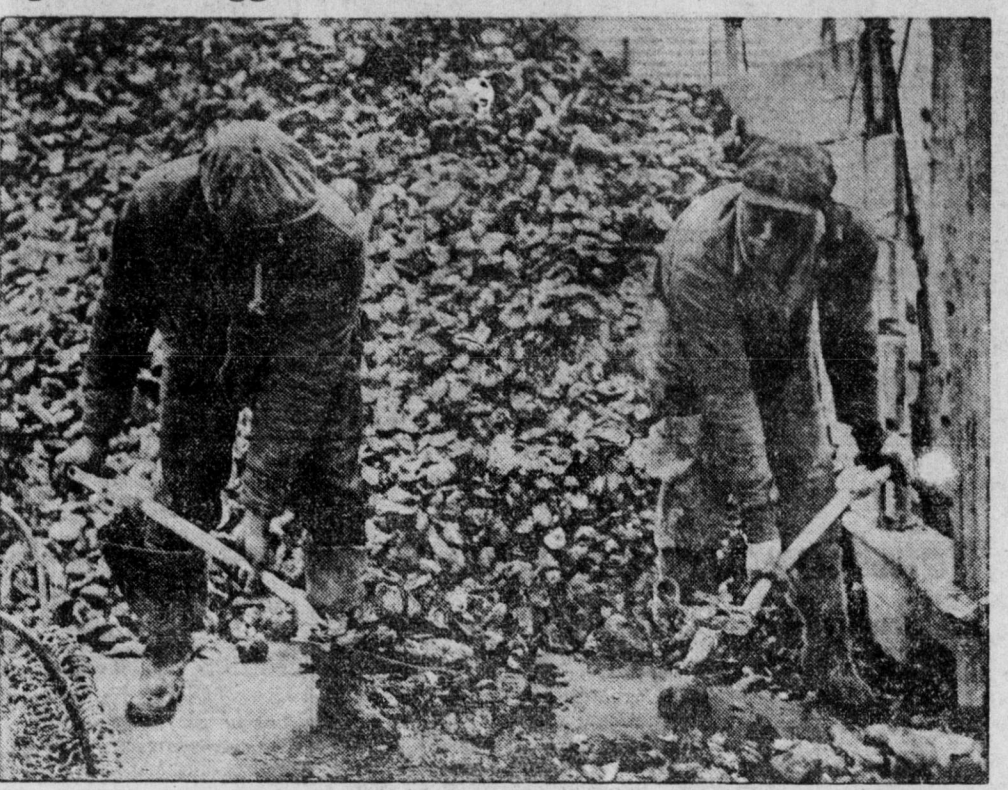
Photo shows Negro workers who slave in rough weather for long hours at clam-digging off

Negro Clam-Diggers Slave for Mere Pittance Near New York