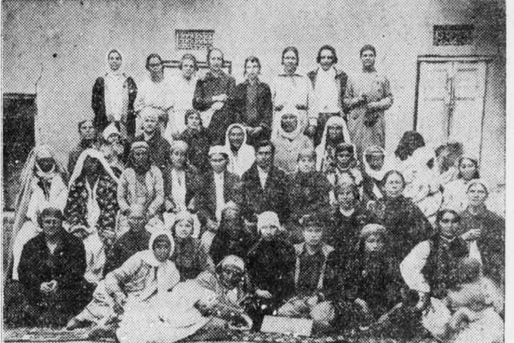
The Revolution brought freedom to the women of Samarkand who are seen here without their monstrous, heavy horse-hair veils. Picture shows the membership of one of the Samarkand co-operatives.

Russian Turkestan Women Discard the Veil