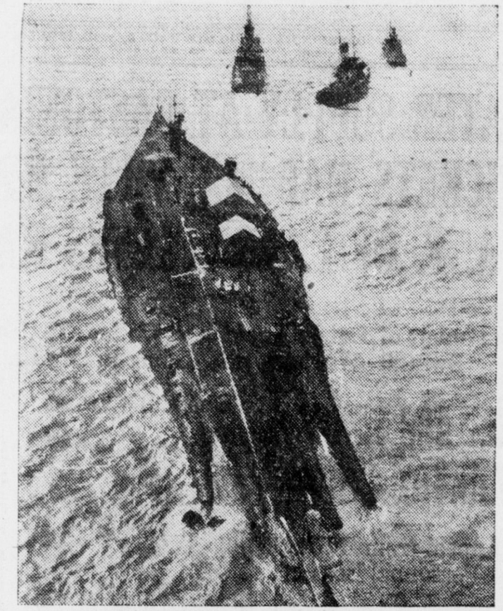
Photo shows the German warship Seydlitz, on which over 100 German sailors, victims of the late imperialist war, went down. The Seydlitz has just been salvaged.