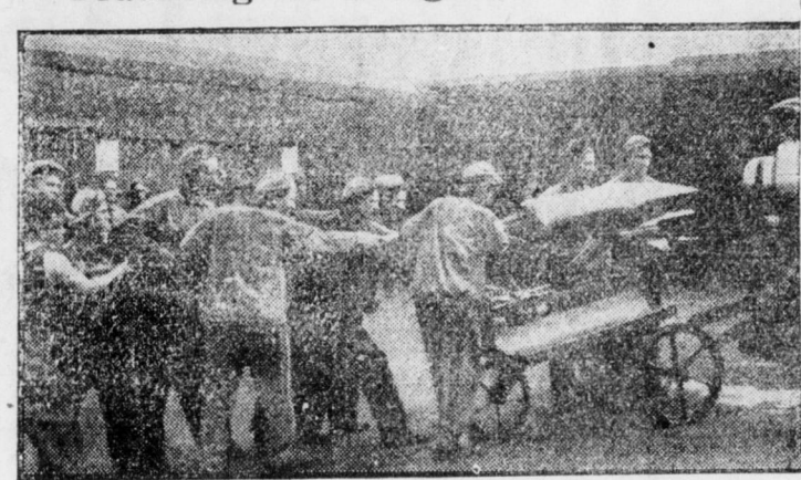
workers in the coming imperialist war.