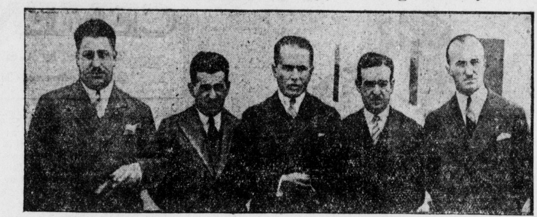
A group of Turkish army aviators, here to be trained in the knowledge of killing workers, attest

U. S. Imperialist Claws in Turkey; Training War Flyers