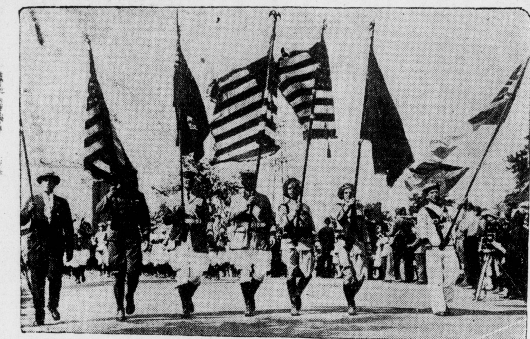
American Legionnaires and Canadian Legion members pledged their solidarity against workers of both countries at the above parade on Warriors Day, held in Toronto.

American and Canadian Fascists Join Hands