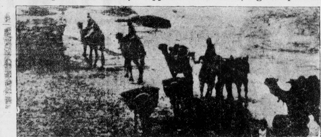
Fellaheen, or Arab land workers, who, robbed of their their land by British imperialism, which handed it to the Zionists, imperialist tools, have revolted.

These Dispossessed Arabs, Stripped of Their Land, Fight Imperialism DRIVE TO FREE Fraternal Organizations COURT IN N. C.