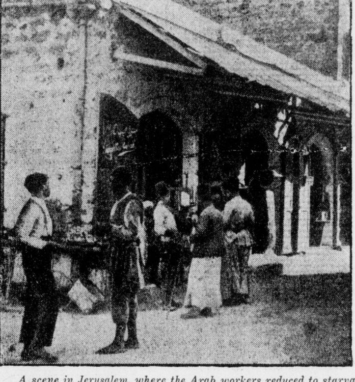
A scene in Jerusalem, where the Arab workers reduced to starvation by British imperialism and Anglo-Jewish capitalists started their.