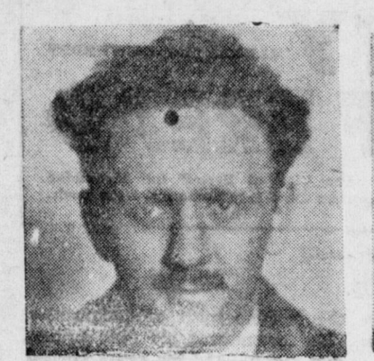
For Alderman, 8th Dist., Man.