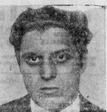
For Assembly, 6th A. D., Bkn.