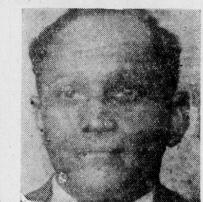
SAZER For Assembly, 6th Dist., Man.