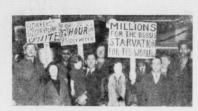
Buffalo unemployed meeting, which organized the march on the City Hall. Mounted police charged the jobless in Buffalo, as in many other cities, but the workers are planning to mobilize even stronger forces for March 6.