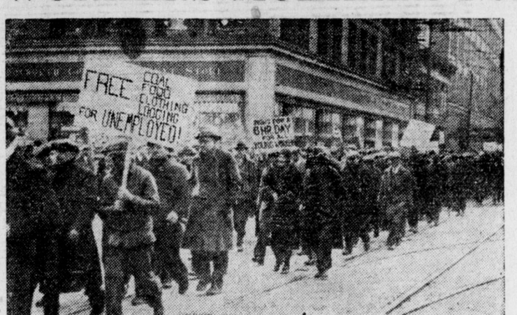
"We will come back 25,000 strong on March 6," said the thousands of unemployed Milwaukee workers at their last march thru the streets. There are over 50,000 unemployed workers in Milwaukee.