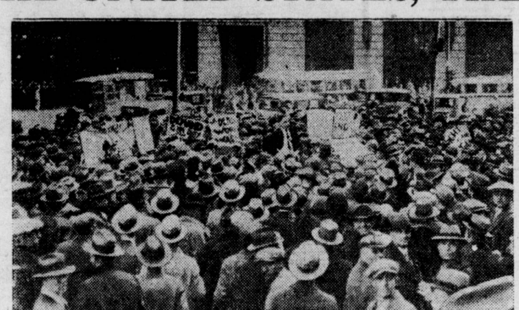
Mass demonstration of unemployed in Philadelphia, held a week ago, at which thousands of workers were present. The Philadelphia Jobless Council is mobilizing a monster demonstration and strike for