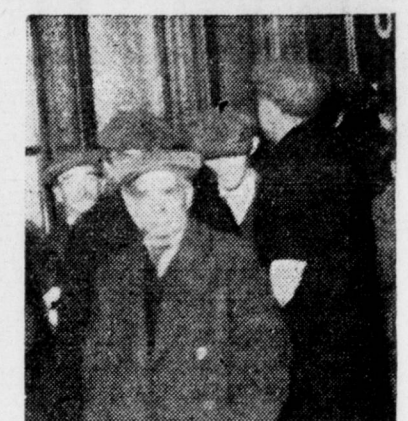
They'll come off the bread lines, too, where thousands of them now wait for rotten soup and slimy coffee. The unemployed will not starve; they will fight for work or

Five More Days to March 6. All Workers, Mobilize For World Unemployment Day. Down Tools and Demonstrate With the Unemployed for Work or Wages.