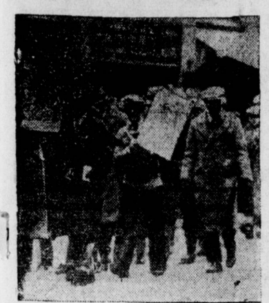
Boston jobless on the march. Thousands of unemployed in Boston marched to the state house. When the governor heard of their presence he beat it out the back