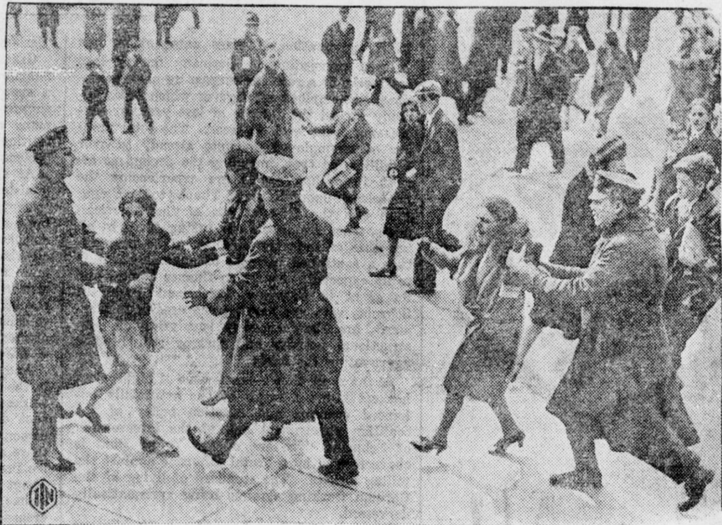
Scene in the demonstration last Saturday in protest against Tammany police brutality against the unemployed demonstrators. Tammany police will not halt the huge demonstration in Union Square today at noon by unemployed and employed workers, against unemployment.