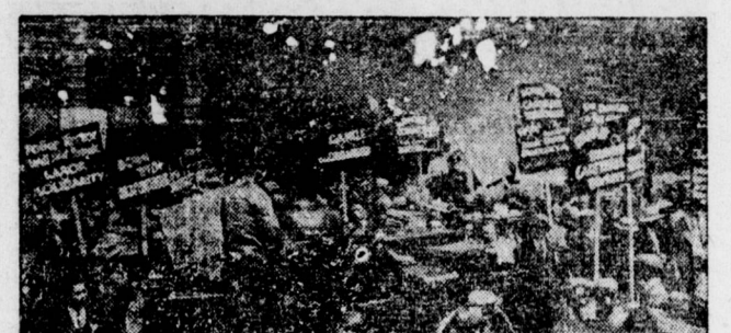
New York workers' demonstration against the Mexican White Terror-part of the nation-wide protest that drove the Wall Street tool, Ortiz Rubio, back to Mexico City.