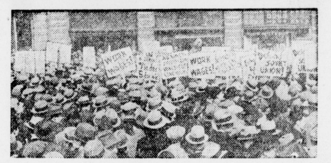
The huge "Work or Wage" demonstration in Union Square, March 6, when 110,000 workers elected the unemployed committee, now jailed by the Tammany court. Forward to a mighty parade and demonstration on May 1!