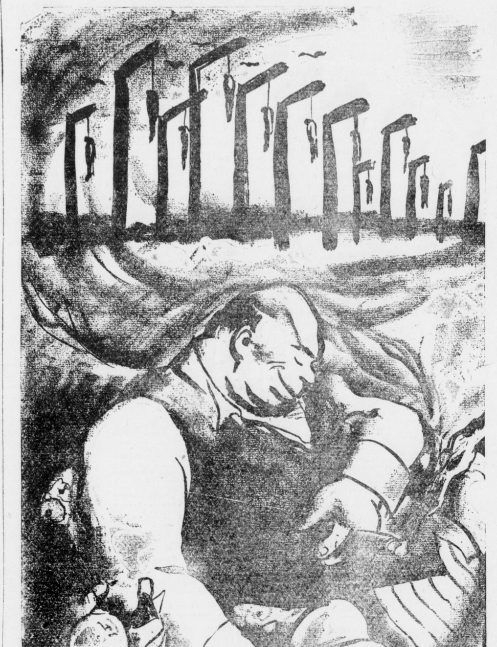
THE BOSSES' IDEA OF PERFECT LAW AND ORDER IN THE SOUTH

A new fire will burn up from this small spark, which in the very near future will make itself felt for world imperialism.