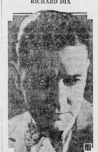
In "Shooting Straight," a new Radio film now showing at the Globe Theatre.

Edmund Lowe will be seen and heard in his latest characterization as the featured player in "Good Intentions," a new Fox drama of the