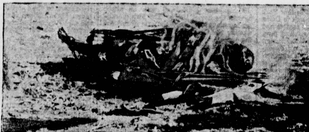
Revolutionary workers and peasants who dare rebel against the imperialist yoke of Wall Street are meted out the most brutal and extreme tortures at the hands of the sadist imperialists. Above photograph shows a revolutionary worker who is being burned at the stake in Nicaragua for being in the fight to free the oppressed Nicaraguan masses. Hundreds of thousands of American workers and peasants against Yankee imperialism and for the establish- ment of revolutionary workers governments on the Western Hemisphere.