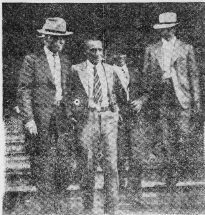
Organizers of the bitterly exploited Imperial Valley agricultural workers who were sentenced up to 42 years for their part in the organization of the Negro, Filipino, Japanese and white farm workers.