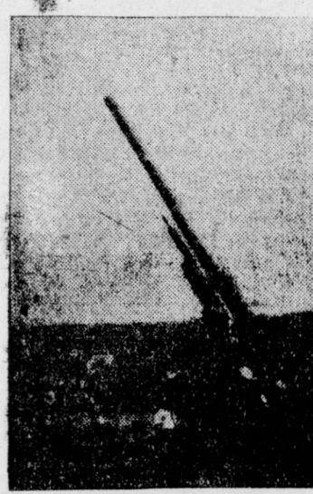
Intensive anti-air craft gun training is now being pushed in all military units. Imperialist war against the Soviet Union—the toilers' fatherland—now threatens the working class of the world. The streets of the capitalist world will shake to the tread of the millions determined to defend the land of their class.