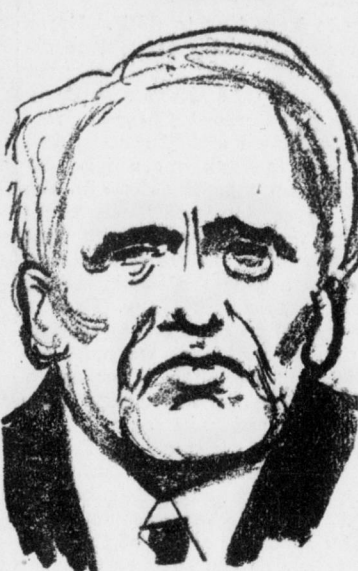
Wall Street's pacifist dopest who helped do his bit for prepar- ing U. S. imperialism for war against the Soviet Union.