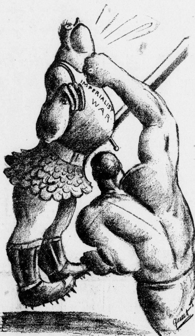
Onto the Streets on August First!