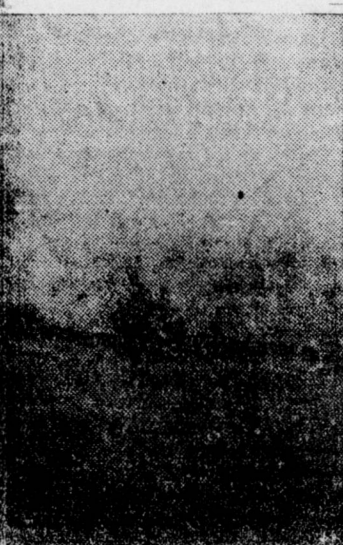
An anti-air craft gun squad of the National Guard in training for war. And anti-air craft guns mean air warfare. Bosses war means intensified misery for the masses. For the revolutionary overthrow of the mass murder system! Out on August 1st!