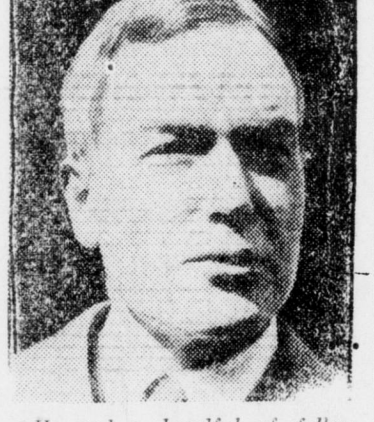
He and a handful of fellow capitalists own the wealth and rule the country.