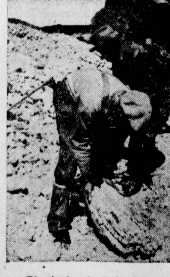
Birmingham's Rock Pile

bunk listening to him and thought having been photographed and ters, etc.; (2) that all workers, not In my place, for instance, there will Birmingham jail, Birmingham jail, white superiority and the Ku Klux of what a fine revolutionist he finger-printed on Saturday was also only the chemists, should receive an be in a few days a discussion on "mistake."