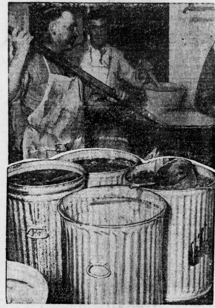
The "Kitchen" in the McGregor Institute, approved by Mayor Murphy as part of his "relief" plan for the unemployed. The picture doesn't begin to show the real conditions. The food stinks. The floors are literally covered with a putrid mass.