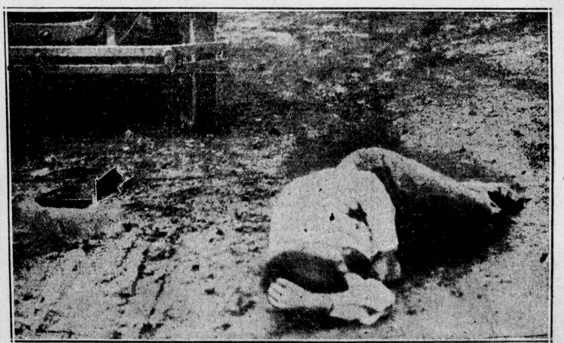
ANOTHER SCENE from the Butler Consolidated coal company gunmen's armed attack on unarmed strike pickets at Wildwood, Pa., Monday. This shows a miner wounded by bullets and shotgun slugs. Just in front of the automobile lies a blackjack which one of the deputies threw aside so that he could use his gun more freely.