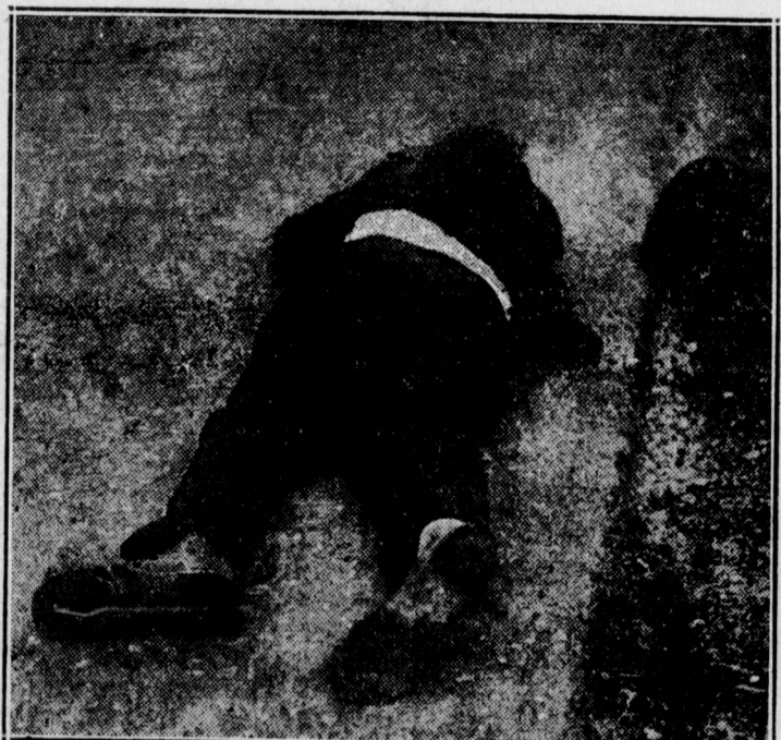
A MINER WOUNDED LYING IN THE ROAD. In an effort to smash picketing the Butler Consolidated Coal Company gunmen fired tear gas bombs at the strikers who were marching on the Wildwood, Pa., mine in defiance of an injunction. The fumes of the gas bombs can be clearly seen.