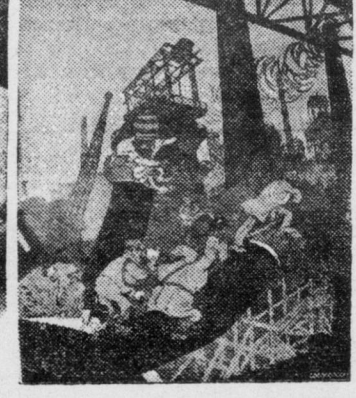
LEFT: A steel plant in the Soviet Union, which has built the largest steel plant in Europe.

RIGHT: A Soviet poster depicting capitalism sending forth its lackeys to war on the Workers Republic.