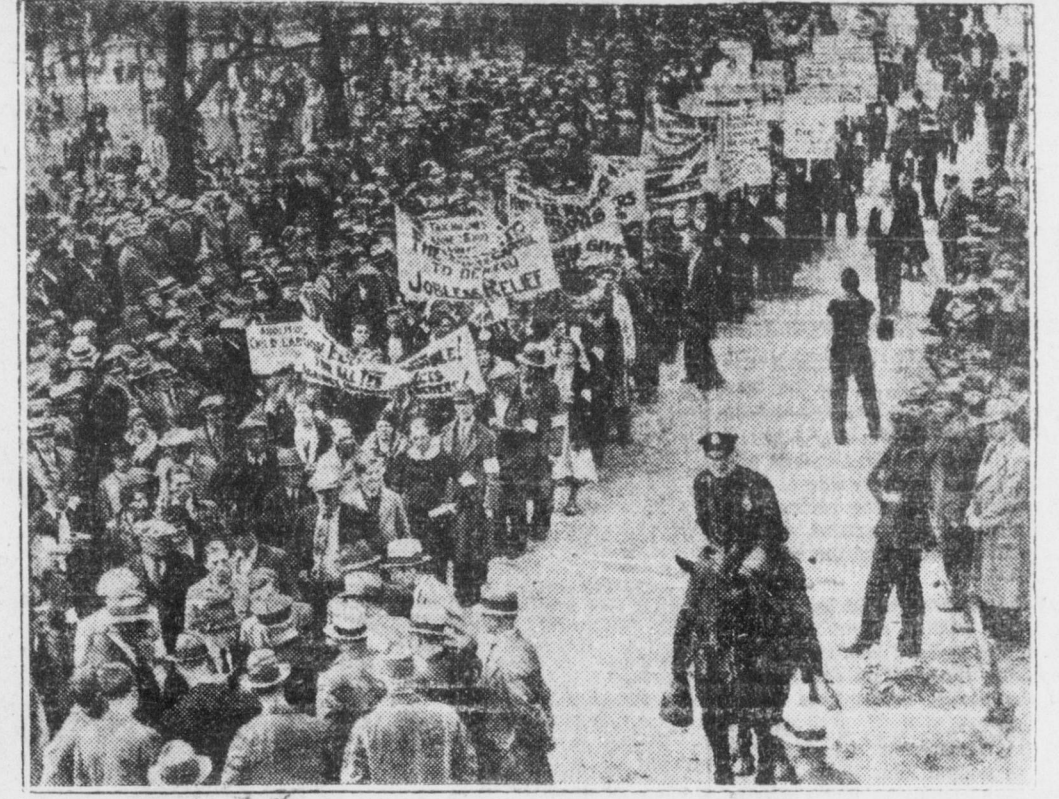
Five hundred Massachusetts 'Hunger Marchers, followed by 10,000 Boston workers enthusiastically supporting them, marched on the State House with the demands of the unemployed workers for social insurance, for abolition of child labor, for immediate relief.