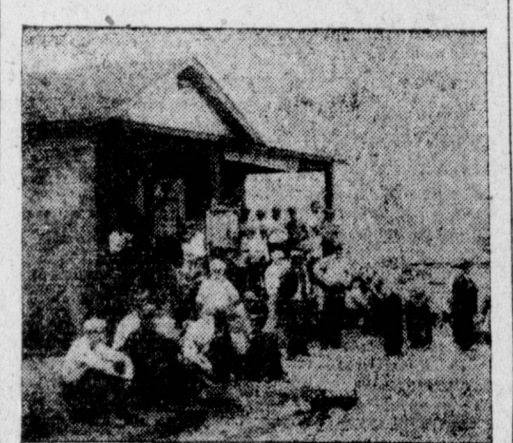
A group of striking miners in Wildwood, Pa.