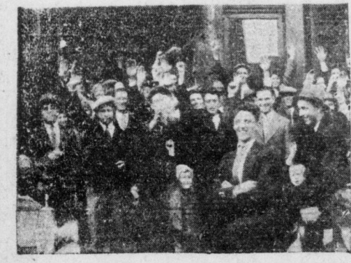
Strikers at the General Fabrics Mill, Central

In the early stage of the wage cutting the workers' response was not so militant, There were many illusions; that the crisis would soon be over, that the first wage cut would be the