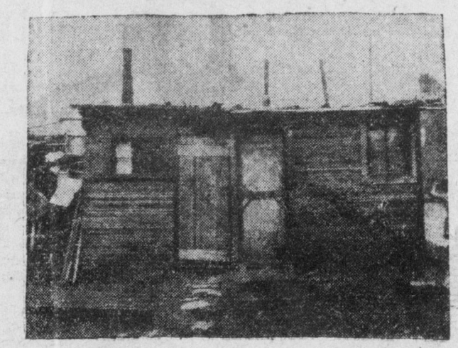
A miserable shack in which unemployed workers live in "Father" Cox's Shantytown in Pittsburgh.

HOUSING CONDITIONS FOR WORKERS IS ELECTION ISSUE FOR CITIES