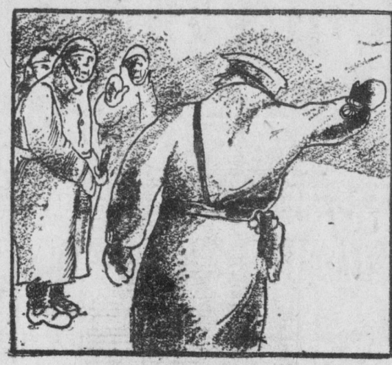
American infantry refused to fight the