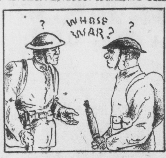
"whys and wherefors" of the