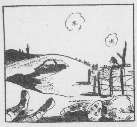
As the war of 1914-18 dragged on, with thous ands being killed and wounded, the men began