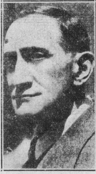
ISRAEL AMTER Candidate for Governor of N.Y. Candidate for Lieut.-Governor