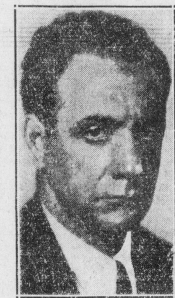
WILLIAM W. WEINSTONE Candidate for U. S. Senator