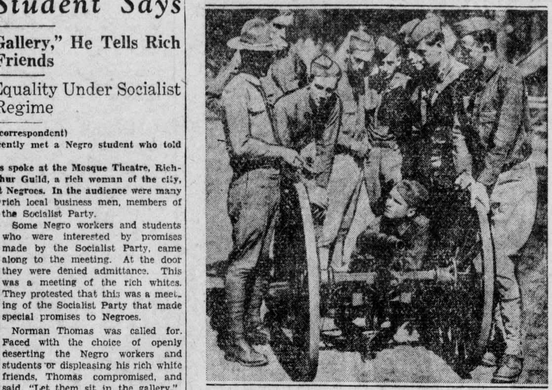
How bosses are training working class youths at Citizen's Military Training Camp for war against the Soviet Union and for use against the

Workers! Fight Against Imperialist War Danger! All Out August First!