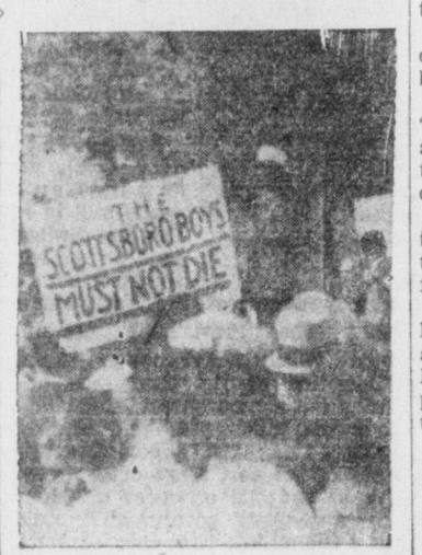
Photo of threatening leaflets dis tributed by Ku Klux Klan in effort block growing unity of Negro and white workers in the struggle against starvation, unemployment and the vicious national oppression of the Negroes. These leaflets are being distributed in other sections of the country, South and North. Other photo shows the workers' answer. A demonstration of Negro and white workers for the Scottsboro Boys.

1.00 4. Freedom of Tom Mooney and called on the police to do the work of smashing the struggles of the starving workers and ruined farmers.