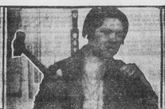
healthy employed workers of the Soviet Union where capitalism and unemployment are both abolished. A woman locksmith shock brigade worker at a ship repair plant, doing her part to build socialism