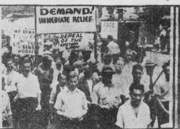
NEW YORK,-One of scores of unemployed demonstrations at relief stations and city hall, demanding cash relief, no discrimination, no evictions, lunches and clothing for school children, etc.