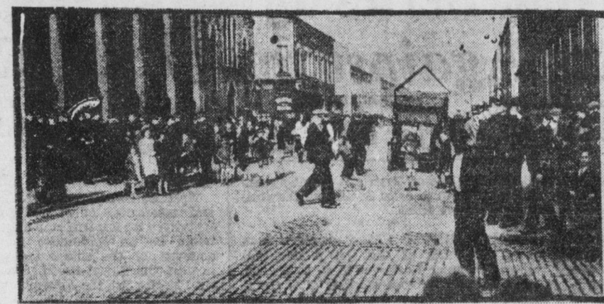
BELFAST .- 20,000 unemployed demonstrated against the cutting off of relief and demanded more food. They fought the police of Northern Ireland and were only subdued by bringing in regiments of the British army.