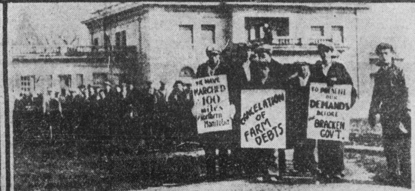
WINNIPEG .- Canadian farmers, hunger marchers, in Winnipeg demanding cancellation of farm debts. Farmers are not only adopting the strike weapon of city workers, but are now forming united front with the city jobless for united picketing and demonstrations.