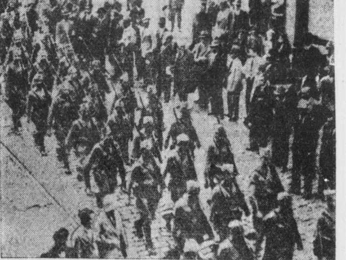
These Federal troops of Brazil were used by their capitalist masters to defeat the rebellion of the coffee states which had lasted three months. They were snapped as they left Rio de Janeiro. (F. P. Pictures).